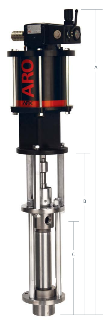
(Model shown w/ball valve regulator)

28:1 Ratio, 8" Air Motor, 2-Ball Lower End